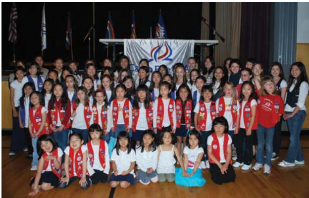
Seattle Betsuin Camp Fire Group then and now

Group Program is central to Camp Fire USA's mission. The clubs connect children to each other and to caring adult role models. Young members learn positive values and develop lifelong skills and interests as they participate in a wide variety of activities, sell candy, earn beads and emblems, and do community-service projects.