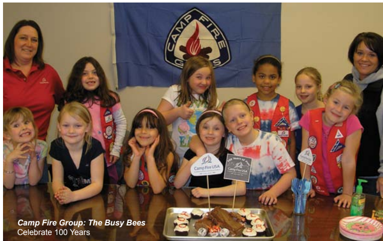
Camp Fire Group: The Busy Bees Celebrate 100 Years

I still remember cooking eggs and bacon over a camp fire. Being in Camp Fire gave me the chance to experience things I wouldn't have otherwise. It also kept me closer to my mother, who was our group leader. When I got older, I carried on the tradition with my own daughter, now 20. My husband, Pat, and I have continued to support Camp Fire as donors and volunteers because it's good for kids and families. It was certainly good for ours.